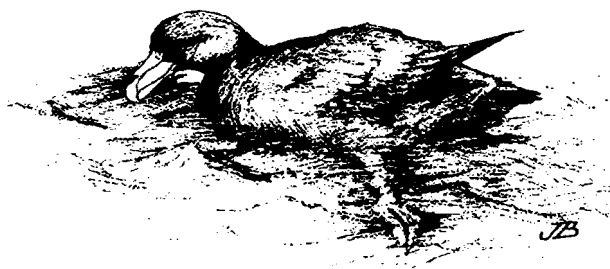
The rather ungainly Southern Giant-Petrel is a frequent visitor to waters off WA's west coast.

We gave the islands our own names, as they are not named on the maps of the area. 'Round Island' was approximately 80 metres in diameter with only about 30 metres in diameter above the water and remaining totally dry. The vegetation was samphire and Cyperus 'grass'.