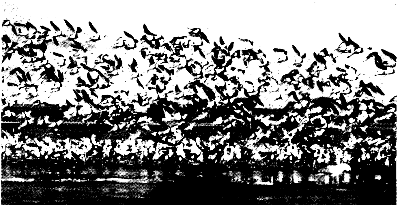
Banded Stilt At Lake Macleod

The mud had an awesome reputation from the reports of previous geological teams reputedly, being of a bottomless quicksand type. As a result initial parties of observers were roped together mountaineering style for mutual safety. In wetter times the sand and mud may be less secure and after it was found no-one seemed to sink beyond the knees, ropes were abandoned. The only other hazard was the discovery that the roots of the fringing mangroves grow over deep water. One of the party had the misfortune to go through into the water to the detriment of binoculars (and the information of all.)