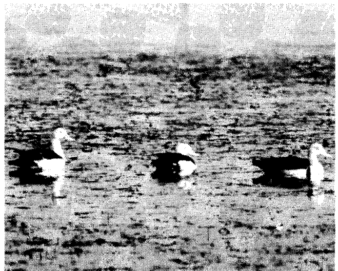
Mats of aquatic plants at Lake Argyle support large populations of waterbirds. Radjah Shelducks were often encountered in August 1986.

From Lake Argyle the team of participants moved to Lake Gregory on the edge of the Great Sandy Desert. Any apprehension about this wetland (it was little known) matching Lake Argyle's uniqueness was immediately suppressed. The count of 60,000 Little Black Cormorants, including 11 breeding colonies, was staggering and the skies 'blackened' as observers boated slowly through the flooded woodland along the lake margin. To the enjoyment of all, the very same areas were harbouring small flocks of Freckled Ducks which eventually tallied 900 individuals. This figure is a record for Western Australia. For some of the team it was their first encounter with this species and to experience such numbers was a rare privilege.