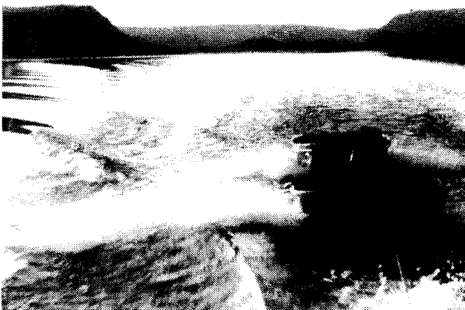
Ranges rising steeply from glassy water, disturbed by birds in boats searching for waterbirds: April '86.

Parties of observers were organized, in R.J.'s inimitable style, into shore or boat patrols and began counts in areas of bird concentrations spotted earlier by aircraft survey. Some of the more impressive statistics included counts, in excess of 50,000, for both Hardheads and Eurasian Coots. Interesting also were counts achieved for Radjah Shelduck (660) and Comb-crested Jacana (300); results that suggest Lake Argyle is important for these birds. Yellow Chats in surprising numbers (more than 100!) delighted the observers; especially as this count represented an important extension of the known range of this diminutive bird. The presence of a pair of Letter-winged Kites brought solace to a pair of fearless ornithologists stomping the hot mud of the eastern shoreline.