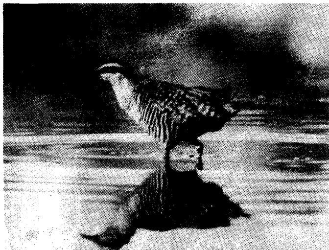
Buff-banded Rail at Alfred Cove: a regular feature.