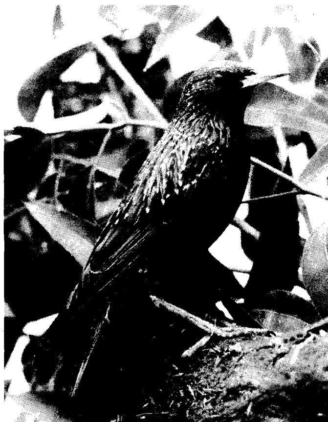
Common Starling Sturnus vulgaris .

Peter Coyle, 14 July 1983 AGRICULTURE PROTECTION ADVISER