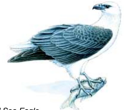
White-bellied Sea Eagle

These breed in the Recherche Archipelago in late spring and migrate north in winter. There are many rookeries around the island. One nesting area is at Twigg's Landing.