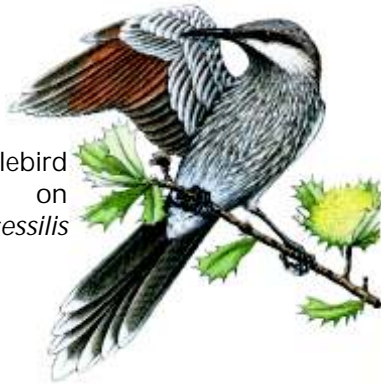
Western Wattlebird on Dryandra sessilis