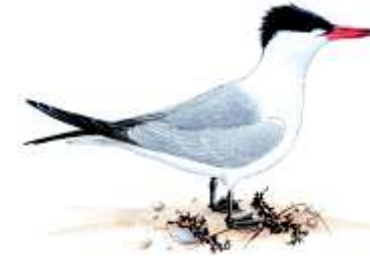
Caspian Tern, the largest of the tern species

On the foreshore opposite Edwards Island see Ruddy Turnstone, Red-necked Stint, Red-capped Plover, Australian Pied Oystercatcher, Bar-tailed Godwit, Sanderling, Fairy, Crested and Caspian Tern and Pacific Gull.