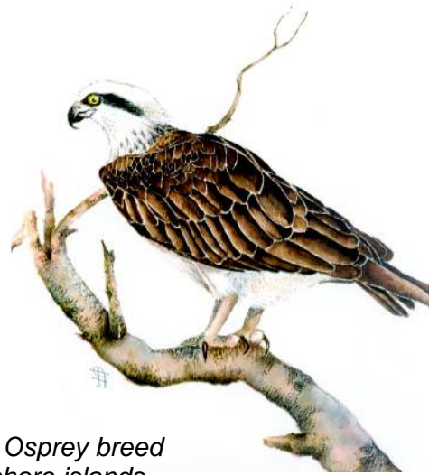
Eastern Osprey breed on offshore islands

Months indicate approximate breeding periods