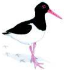
Australian Pied Oystercatcher

* Group excursions are organised to these lakes on private property. To reduce impact and inconvenience, try to join us on these occasions.