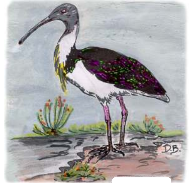
Straw-necked Ibis Artist: Diane Beckingham

Number 16a in a series of Bird Guides of Western Australia